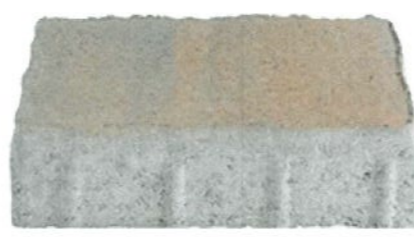
24 x 12 / h 8 cm