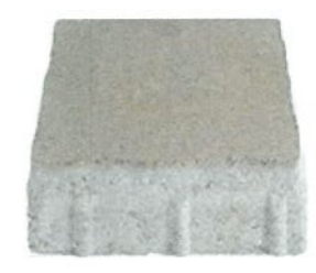
18 x 18 / h 8 cm