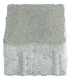
12 x 12 / h 8 cm