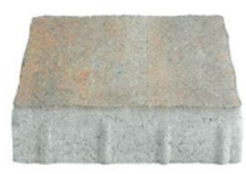
24 x 18 / h 8 cm